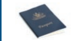
Copies of important family documents (birth certificates, passports and licences)