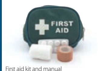
First aid kit and manual