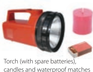
Torch (with spare batteries), candles and waterproof matches