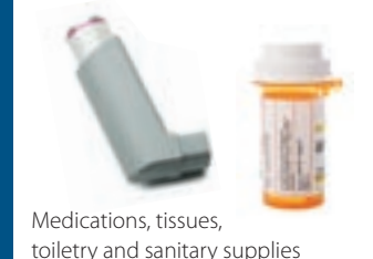
Medications, tissues, toiletry and sanitary supplies