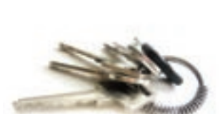
Extra car and house keys