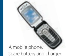
A mobile phone, spare battery and charger