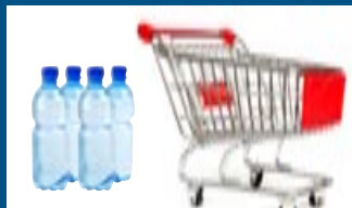
Emergency food and water supplies