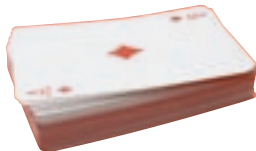
Books, playing cards or games