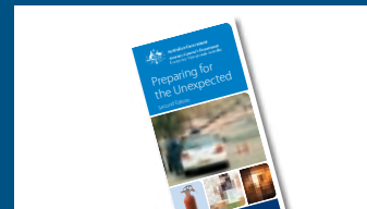
A copy of this booklet