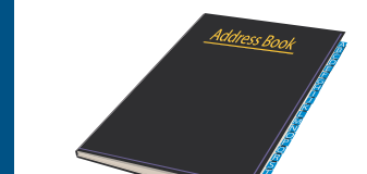
Contact details for your agreed out-of-town contact