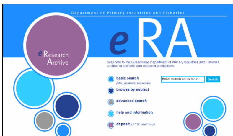
Figure 1. DPI&F eResearch Archive Home Page

The software upgrade went smoothly with minimal downtime. Departmental web designers worked with the Library team to design and create the new home page. This was followed by data migration, user testing, creation of help information for public and staff users and promotional material. The upgrade, data migration and hosting service required considerable communication with the EPrints staff in Southampton and, despite the time difference, we were extremely impressed with their speed of response and their willingness to fix problems and provide solutions. Prior to the repository going live, data was provided to several repository harvesters such as OAISTER and ARROW and search engines such as Scirus and Google Scholar ensuring that the discovery of records in the eResearch Archive will be greatly enhanced.