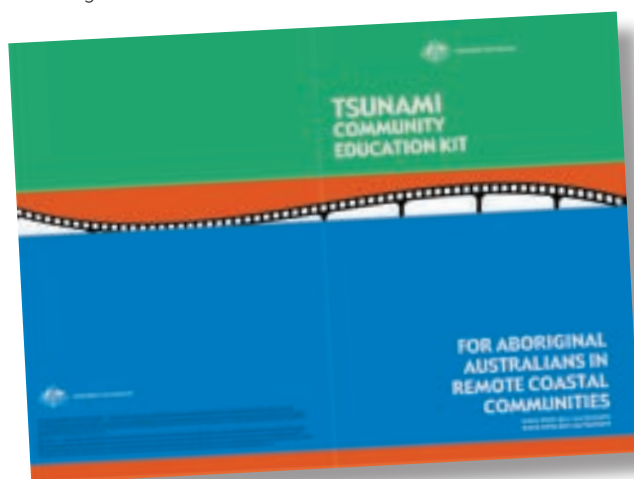
New Tsunami Education Kit