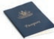
Copies of important family documents (birth certificates, passports and licences)