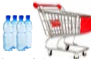
Emergency food and water supplies