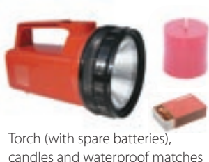
Torch (with spare batteries), candles and waterproof matches