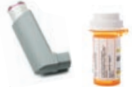
Medications, tissues, toiletry and sanitary supplies