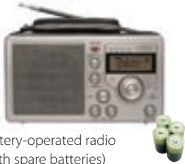
Battery-operated radio (with spare batteries)