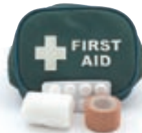
First aid kit and manual