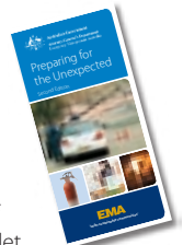
A copy of this booklet