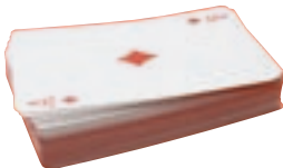
Books, playing cards or games