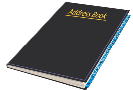
Contact details for your agreed out-of-town contact