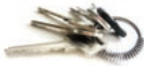
Extra car and house keys