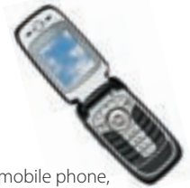
A mobile phone, spare battery and charger