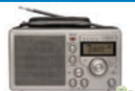
Battery-operated radio (with spare batteries)