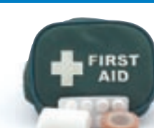
First aid kit and manual