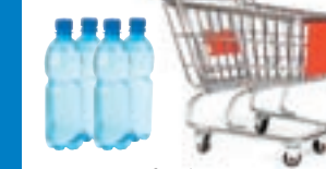
Emergency food and water supplies