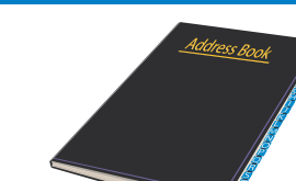
Contact details for your agreed out-of-town contact