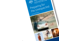
A copy of this booklet

© Commonwealth of Australia 2008 First published 2003 Second edition 2007 Third edition 2008 Fourth edition 2010 Published by Attorney-General's Department