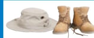
Spare clothes including strong shoes, broad brimmed hat, leather gloves and sunscreen for each household member