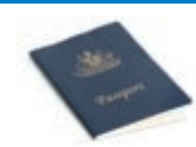
Copies of important family documents (birth certificates, passports and licences)