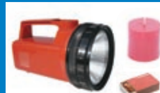
Torch (with spare batteries), candles and waterproof matches