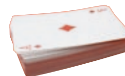
Books, playing cards or games