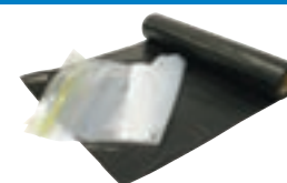
Strong plastic bags (for clothing, valuables, documents and photographs)