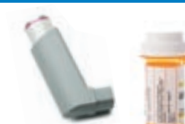
Medications, tissues, toiletry and sanitary supplies