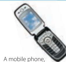
A mobile phone, spare battery and charger